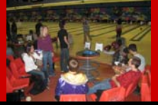
Golfing, Bowling, Cooking and Dining