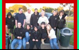
Fellowship, Meditation, Sharing our Experience, Strength and Hope with Others